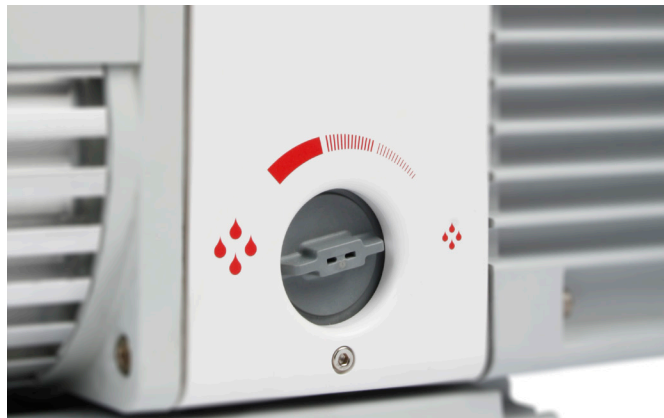
Mode switch on an RV pump

The mode switch is a unique feature of the Edwards Vacuum RV range of oil sealed rotary vane pumps. It is used to change the pump from high vacuum mode to high throughput mode allowing RV pumps to do double duty in a wide variety of applications where previously both single stage and two stage rotary vane pumps would have been required for reliable operation.