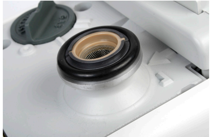
Closeup of inlet

Moving the mode switch to high vacuum mode re-enables the pump’s lowest pressure ultimate capabilities on-the-fly.