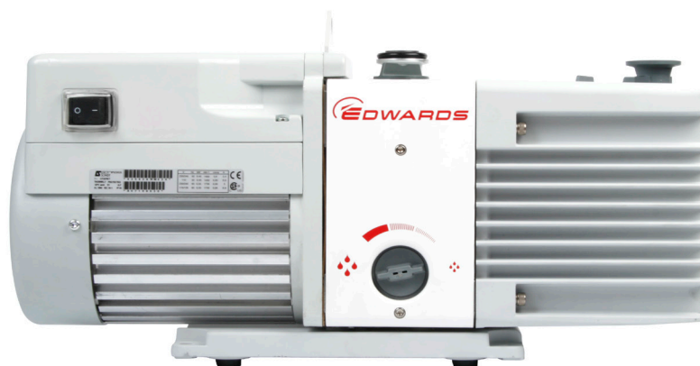
Edwards RV oil sealed rotary vane pump showing mode selector

Shutting down a vacuum pump with water or other condensed vapours will cause corrosion and damage to the inside of the pump mechanism, requiring repairs to be undertaken to return the pump back to "new" performance. Equally pumping condensable vapours with a cold pump will lead to condensation in the mechanism. The recommendation is to operate the pump at normal running temperature before and after pumping vapours, for between 30 and 60 minutes.