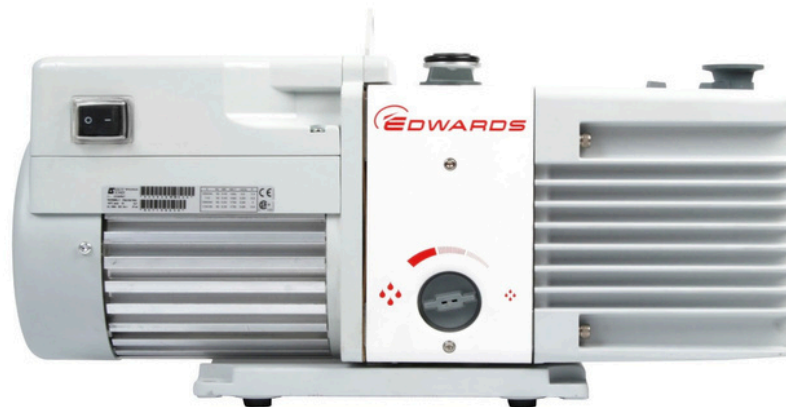
Edwards RV oil sealed rotary vane pump showing mode selector

Shutting down a vacuum pump with water or other condensed vapours will cause corrosion and damage to the inside of the pump mechanism, requiring repairs to be undertaken to return the pump back to "new" performance. Equally pumping condensible vapours with a cold pump will lead to condensation in the mechanism. The recommendation is to operate the pump at normal running temperature before and after pumping vapours, for 60 minutes or more dependent upon the size of the pump.