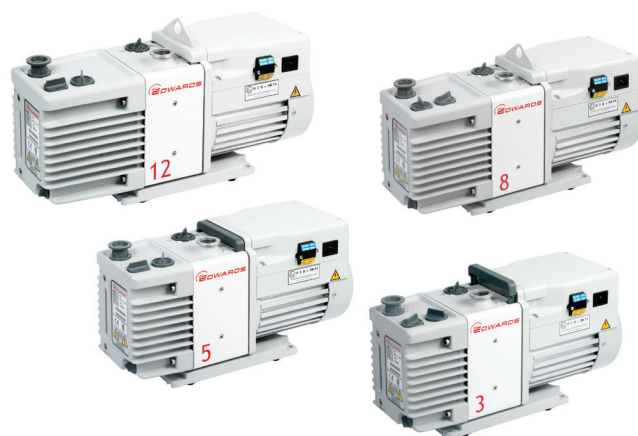
Edwards RV oil sealed rotary vane pump range

When an oil sealed rotary vane pump has high gas through put, for example when roughing a large chamber down from atmospheric pressure, oil mist will be seen at the pump’s exhaust. Examples of other occasions to generate oil mist at the exhaust include pumping a high gas flow introduced in the vacuum system or when running gas ballast. Over time, this oil mist can cause the pump to lose a significant amount of its oil charge, possibly emptying the pump’s oil. In a laboratory this can cause oil to be drawn into an exhaust ducting system or into the environment.