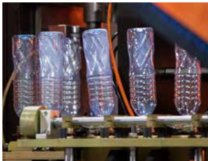
Plastic bottle moulding

Once the fluorination process is complete, the chamber and pipelines are flushed with nitrogen multiple times by bringing the vacuum chamber to 1 mbar and releasing to the atmospheric pressure to rinse the components, and to evacuate the chamber of exhaust gases.