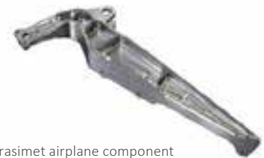
Brasimet airplane component