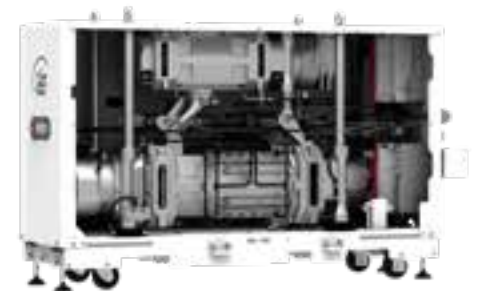
GXS vacuum pump