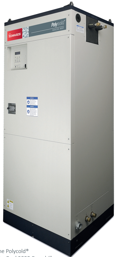
The Polycold® MaxCool 2000 Cryochiller is compliant with European Application Refrigerants (EC 1005/2009) and the US EPA SNAP

MaxCool Cryochillers are the most cost-effective upgrade that you can add to any diffusion-pumped, turbo-pumped, or helium-cryopumped system.