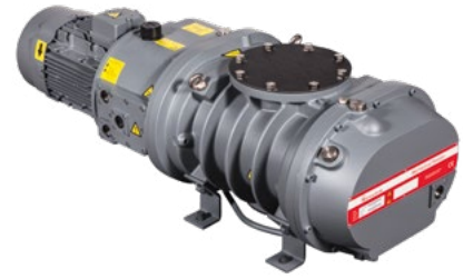
EH Mechanical Booster Pump