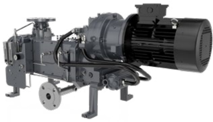
EDS Screw Pump