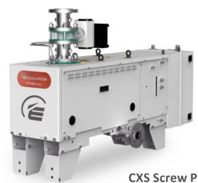
CXS Screw Pump