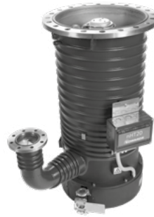
nHT Diffusion Pump