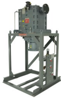
EDP Claw Pump