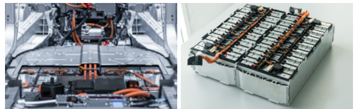
LITHIUM-ION BATTERY PRODUCTION FOR CARS