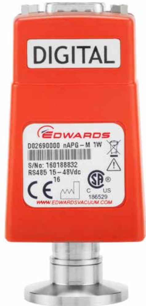
nAPG DIGITAL ACTIVE PIRANI VACUUM GAUGE