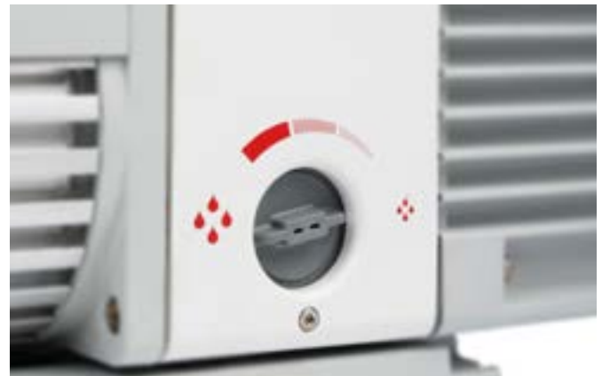
Figure 1 - Mode switch on an RV pump

The mode switch is a unique feature of the Edwards Vacuum RV range of oil sealed rotary vane pumps. It is used to change the pump from high vacuum mode to high throughput mode allowing RV pumps to do double duty in a wide variety of applications where previously both single stage and two stage rotary vane pumps would have been required for reliable operation.