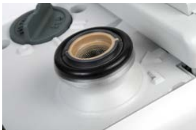
Figure 4 - Closeup of inlet

If the inlet pressure is being measured, one of the things that will be noticed is that the ultimate pressure the pump can achieve in high throughput mode is approximately one decade higher than in high vacuum mode; 2 \times 10^{-2} Torr or 3 \times 10^{-2} mbar.