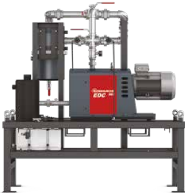
EXDM 1 Filter System

Not just pumps but complete vacuum solutions