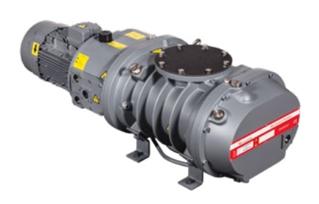
EDS Screw Pump